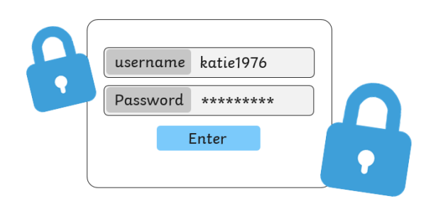
Do not share passwords or personal information.